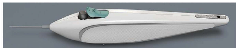
Figure 1 iStent inject ® trabecular micro-bypass stent system: stents and injector.